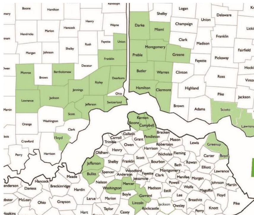
Figure 2. Cincinnati Area MRF-Shed for Rumpke Waste and Recycling