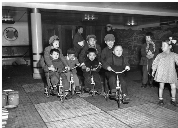
Figure 1. Children of repatriated families on the deck of the Koan Maru before disembarking at Maizuru Bay, Japan on March 24, 1953. The first 2,000 Japanese repatriates from North China arrived at Maizuru on the Koan Maru after being stranded since the end of World War II in 1945.

every sector from counter-intelligence and war trials, to atomic post-blast investigation and policy issuing. 33 Japanese as the post-colonial lingua franca also positioned one thousand MIS Nisei as first-responders on the Korean Peninsula in late 1945, where interpreters were required in the process of repatriation (see figure 1). 34