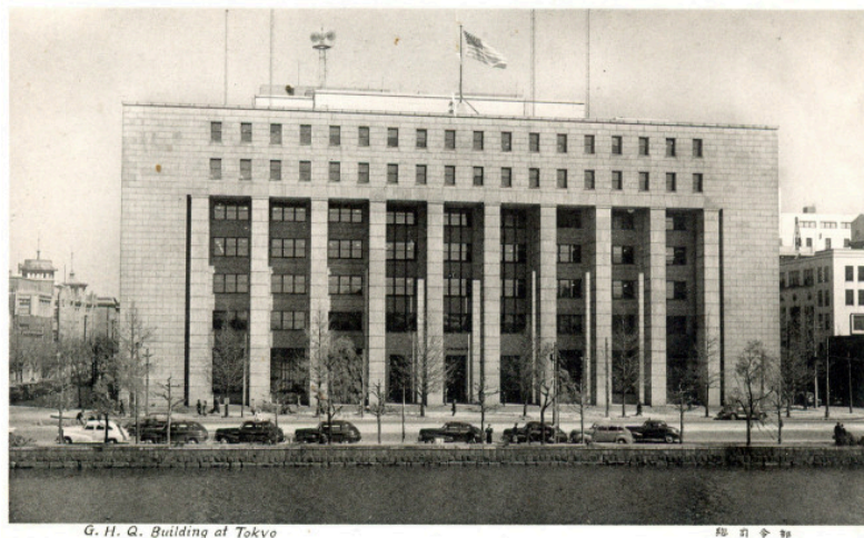
Figure 2. Dai-ichi Sogo Building, Marunouchi, c. 1949. [“G.H.Q. Building at Tokyo /總司令部”]