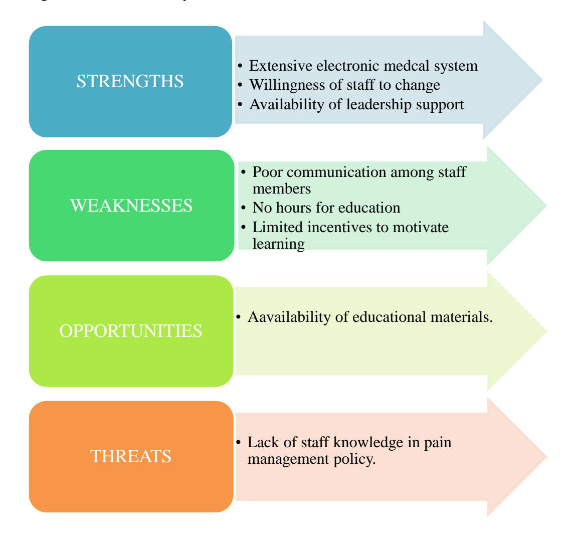
Figure 1.2: SWOT Analysis