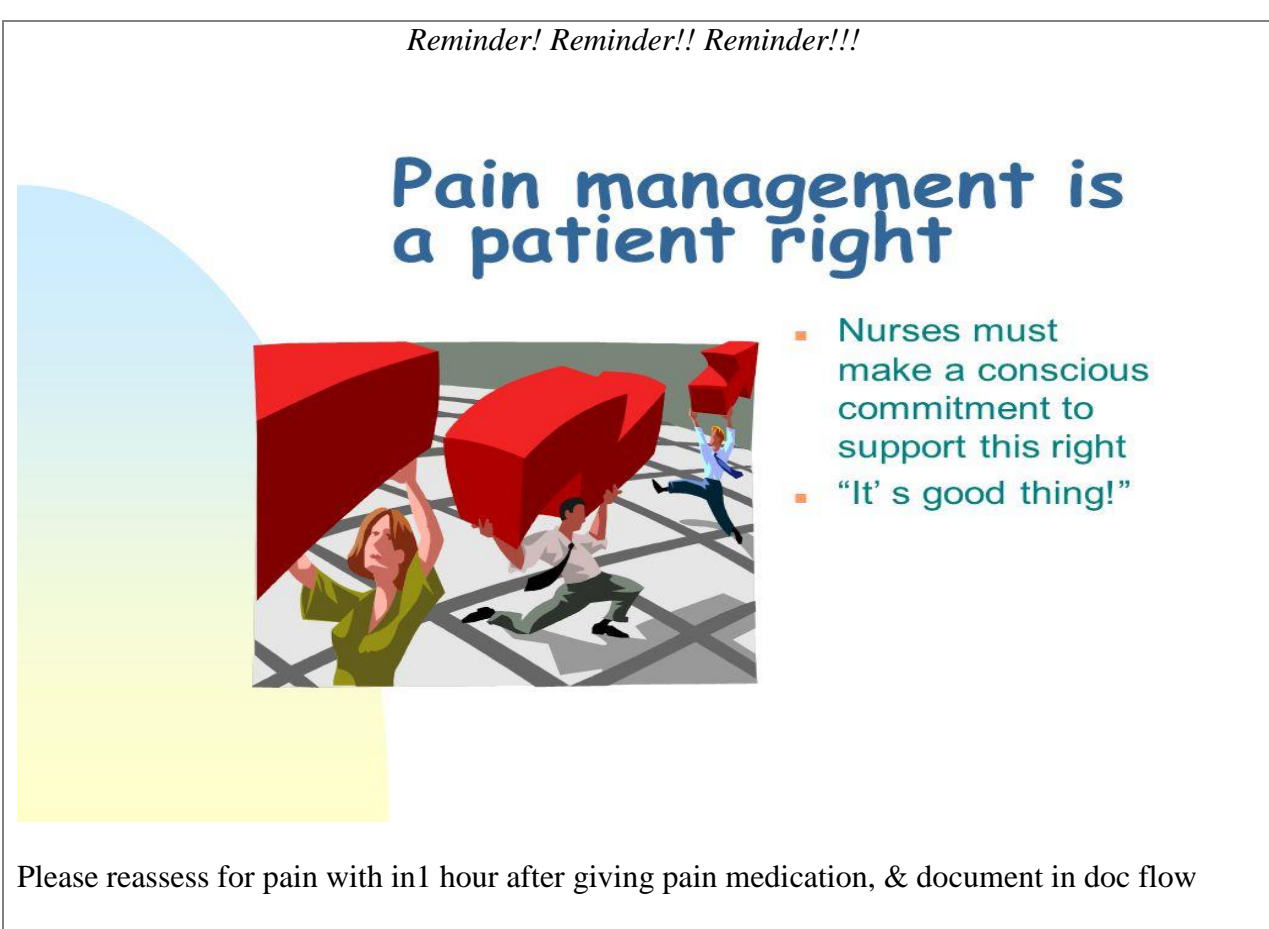
Figure 1.1: Sample Visual Aid Posted at Workstations.

sheet. It is TJC standard and facility policy!