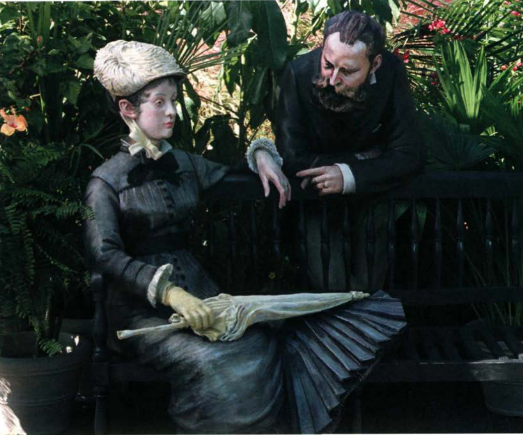
"A Thought to Consider" by J. Seward Johnson, © 2000 The Sculpture Foundation