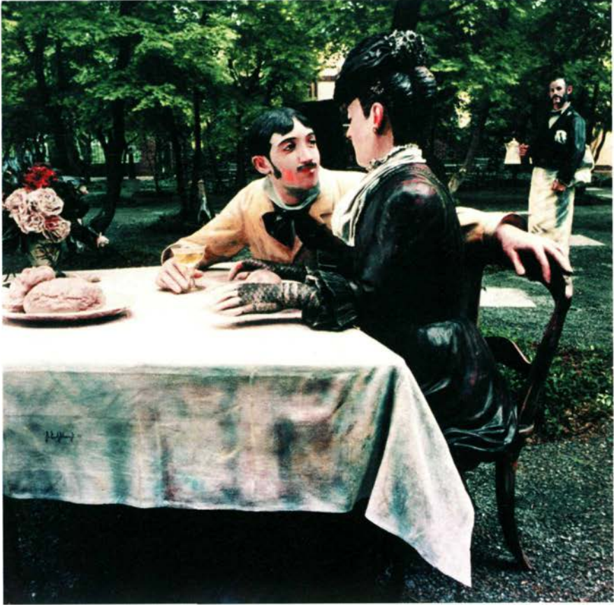
"Eye of the Beholder" by J. Seward Johnson, © 1997 The Sculpture Foundation