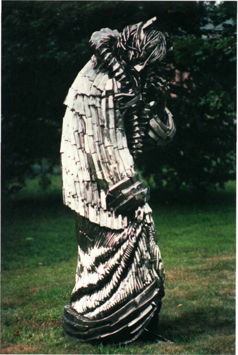
"King Lear" by J. Seward Johnson, © 1982 The Sculpture Foundation