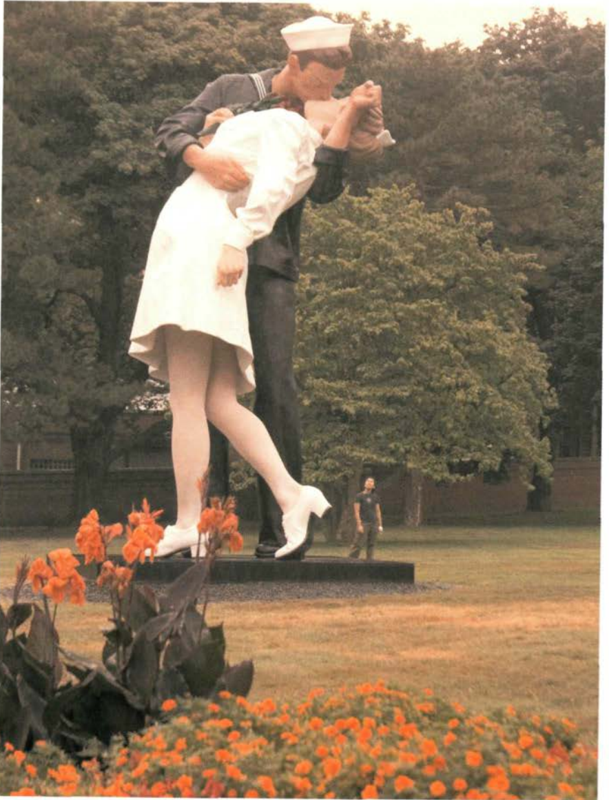
"Unconditional Surrender" (25') by J. Seward Johnson