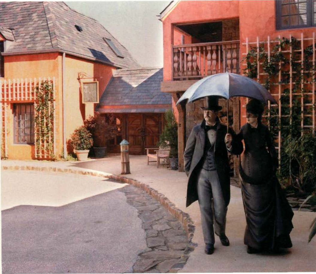
"La Promenade" by J. Seward Johnson, © 1995 The Sculpture Foundation