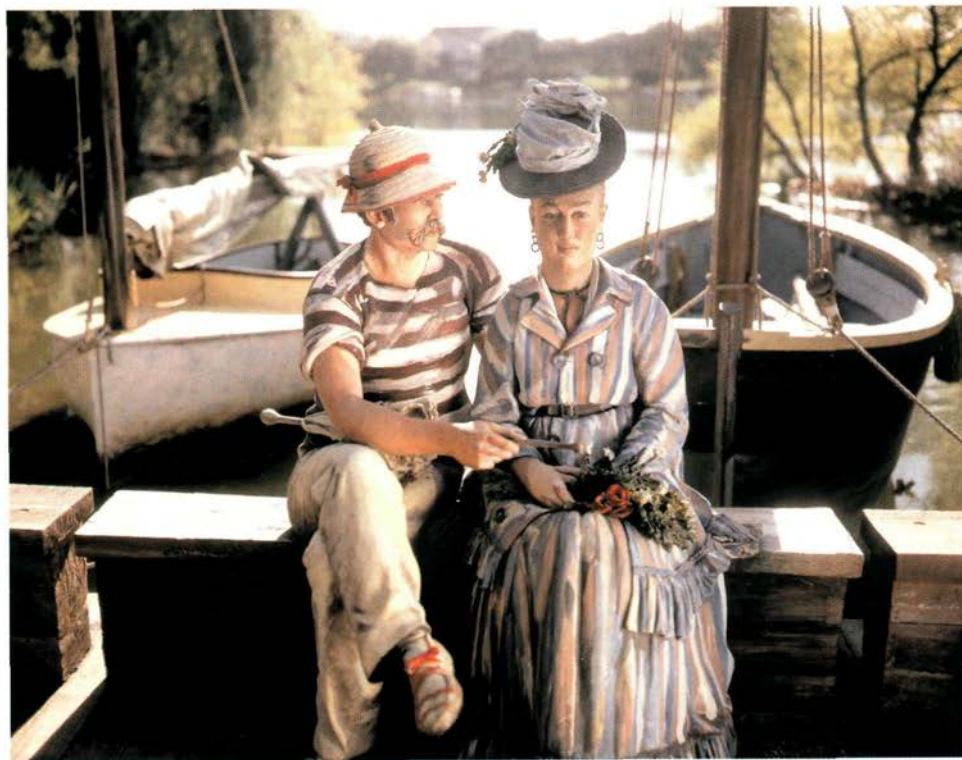
"Sailing the Seine" by J. Seward Johnson