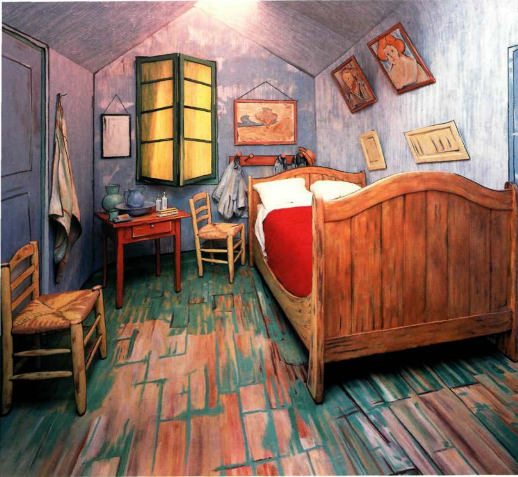
“Welcome Home” by J. Seward Johnson