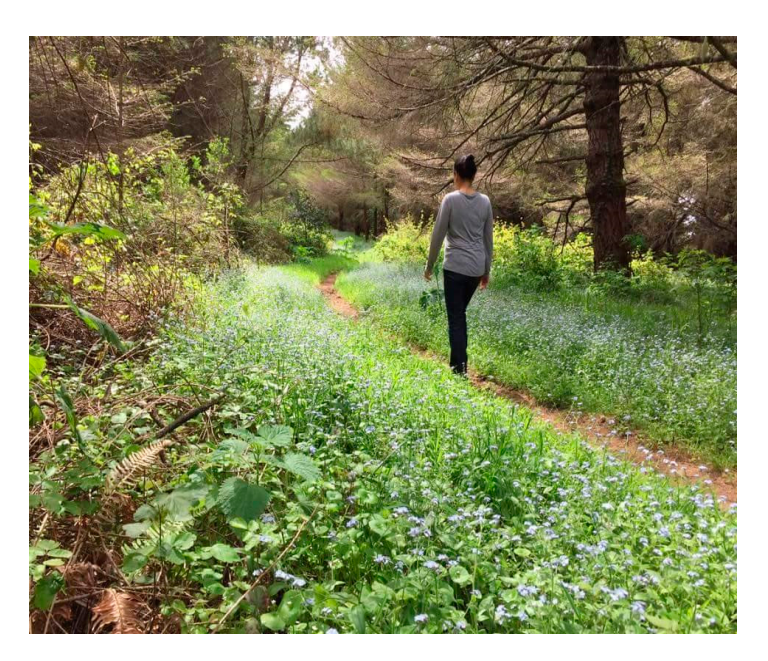
Figure 3. Walking in nature.

Morita et al. [46] noted while SY has been popularized in Japan given the ease of access to forested environments and its' conscientious governmental recommendations, individuals globally have reduced acute psychological distress from time spent in greenspace (Figure 3).