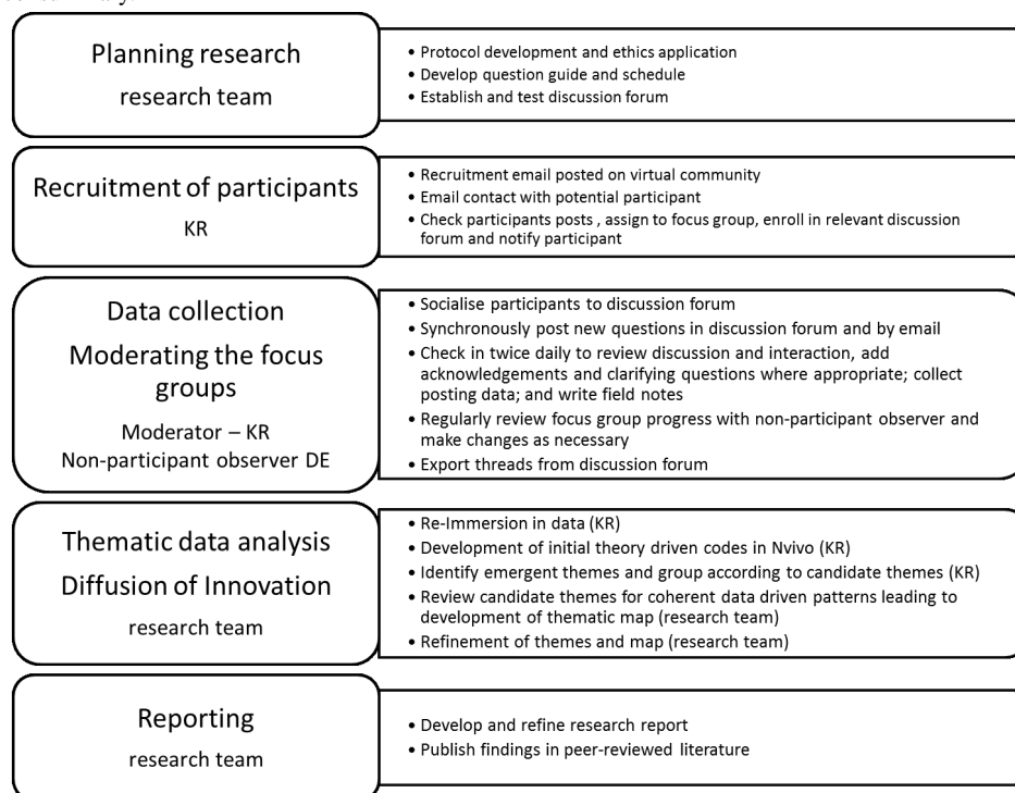
Figure 2. Study protocol summary.