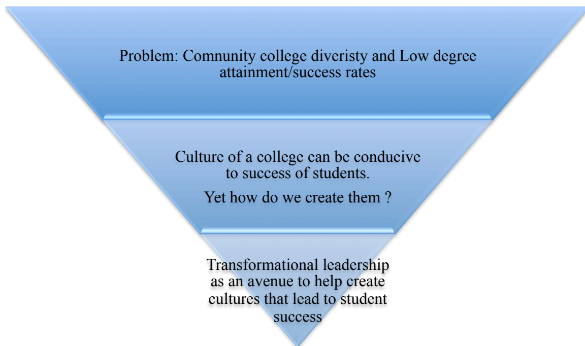
Figure 1. Outline of the statement of the problem