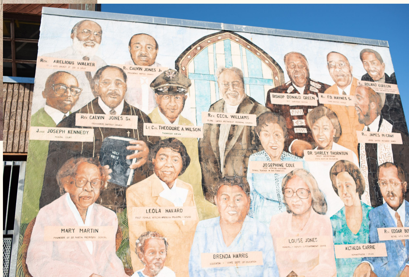
Photograph of Southeast corner of the Inspiration murals by Brian Brooks @underdogfilmlab