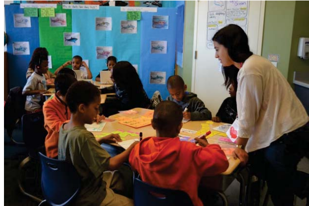
USF Early Literacy students engaging with pupils in the Western Addition at Mo'Magic.