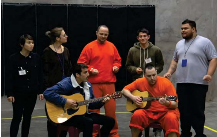
PACE students facilitate classes twice a week, off campus with men in the Resolve to Stop the Violence Program (RSVP), a non-violence program in San Francisco Jail #5.