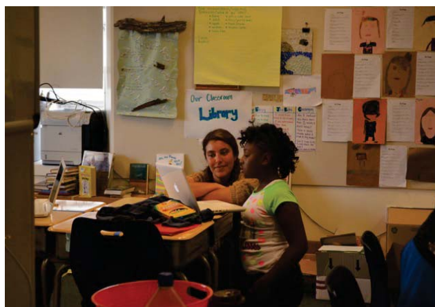
USF practicum student working with a student in the Western Addition at Mo'Magic.

I am inspired by the shared leadership model we have developed in collaboration with our community partner, Mo'MAGIC, and the opportunity for USF candidates to learn from the community.