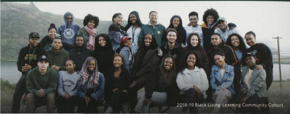
2018-19 Black Living-Learning Community Cohort.

With its comprehensive coverage, BASE creates a climate in which black students at USF feel included, feel supported, and feel equipped and inspired to change the world for the better.