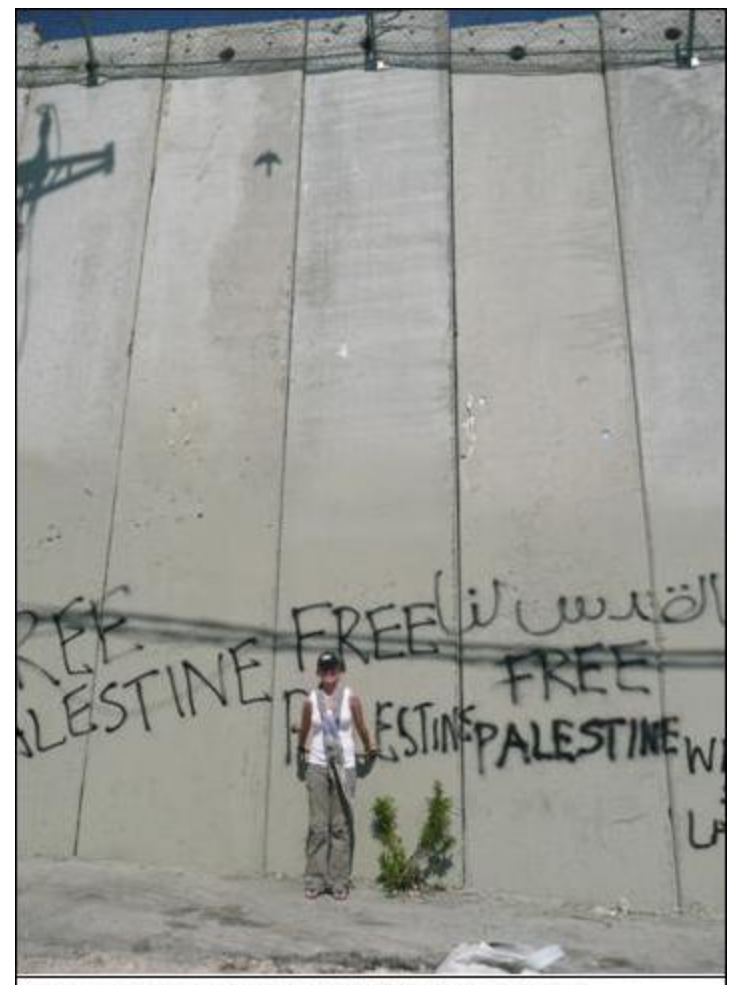
Image 1: The author in front of a section of the separation barrier.

2006). The present conflict is not over the formation of a Jewish State; such a state exists within the 1949 borders and is going nowhere (despite the fact that some supporters of Israeli policy may say otherwise). Rather, today the conflict centers on the Israeli colonization of the occupied Palestinian territories (oPt) (the West Bank and Gaza Strip). This thesis will focus primarily on the West Bank where Israeli expansion is