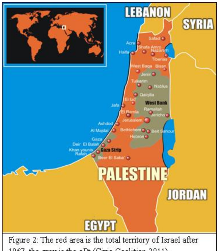
1967, the grey is the oPt (Civic Coalition 2011).

Skipping ahead a bit, in 1993 the first protocol of the Oslo Accords called for letters of mutual recognition to be exchanged between Yasser Arafat and Yitzhak Rabin. In his letter, Arafat recognized the state of Israel, therefore conceding that the pre-1967 borders of Israel are non-negotiable – that the land claimed by Israel in 1948 is forever lost to the Palestinians. Therefore, all future negotiations over the border between Israel and a future Palestinian state would concern the West Bank and Gaza Strip territories (Gelvin 2005, 2007, 234). This will serve as my working definition of "Israel" and "Palestine" – Israeli land is that to the west of the 1949 armistice line (Green Line), and