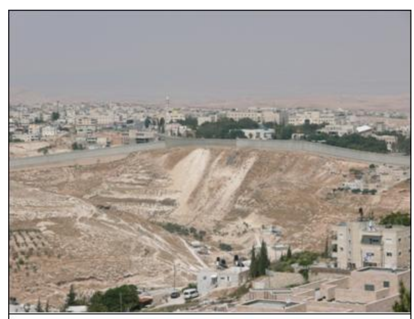
Image 2: The barrier in East Jerusalem (From personal collection).

creates a revised starting point for any future negotiations of the conflict, the fact that it requires the uprooting of Palestinians whose land is then confiscated, the fact that it cuts off some Palestinian villages from the rest of the West Bank, and the fact that it separates towns from the land they farm (Gelvin 2005,