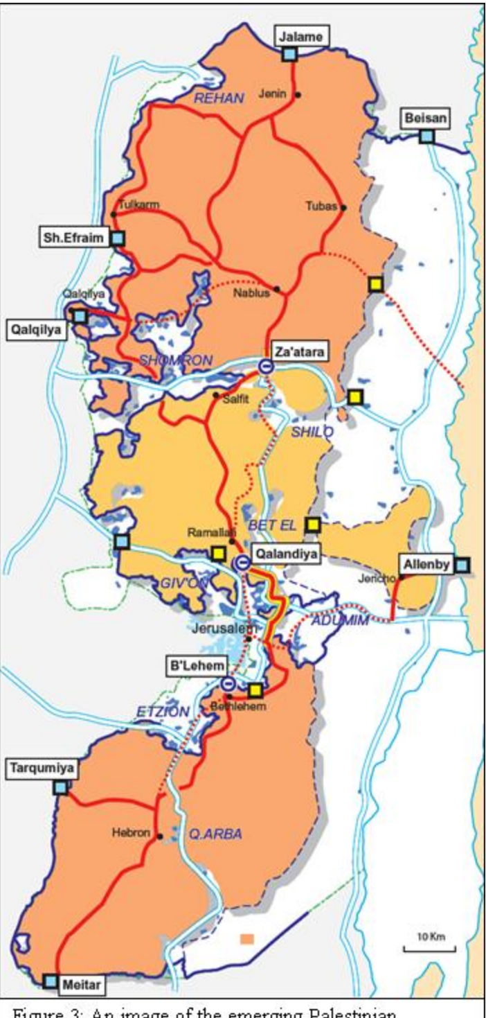
Figure 3: An image of the emerging Palestinian Bantustans in the West Bank (Civic Coalition 2011).

2011). A Gush Etzion settler who gave an informal lecture while I was in Israel opened his talk by telling us about a Japanese game in which the players use black and white counters in order to surround their opponent and win the game (From personal notes: settler, Gush Etzion, Israel, June 27, 2011). He compared this to what is happening between Jews and Arabs in the area surrounding the settlement in the West Bank where he lives. I suppose he was trying to explain the Israeli strategy of cantonization by which Israel encircles each Palestinian pocket with Israeli settlements