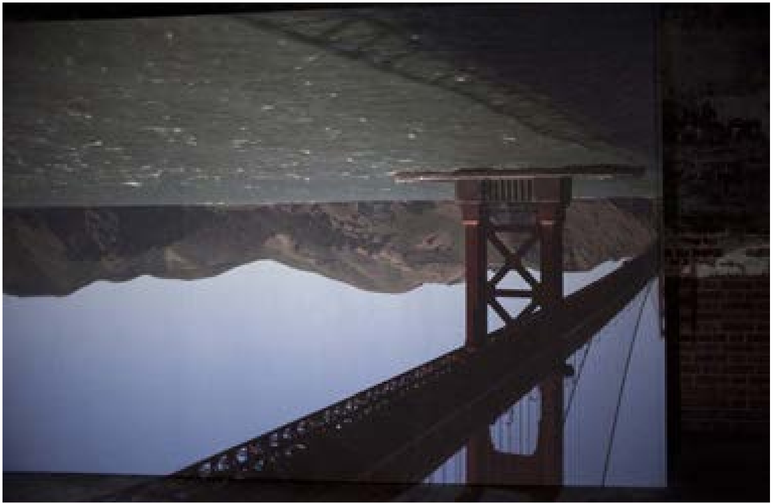
Abelardo Morell. Vertigo , 2012; site-specific double camera obscura using Fort Point windows to reflect an inverted image of the Golden Gate Bridge into the interior space of the East Bastion of the Fort. Courtesy of the Artist and the FOR-SITE Foundation. Photo: Jan Stürmann.

While these works are all time-based, the last two pieces constitute forms of engagement with the past. Time-based works rarely compose the foundation of a public art project—permanently installed sculptural works are the norm—but it is more fascinating that the medium intersects with the themes of the works here. The effect is remarkable because history cannot be grasped in a glance. To direct the attention of a casual observer towards history requires both commemoration and encouragement. It is one thing to come to Fort Point, learn about its former function as a military sentry, and appreciate the scenic beauty and monumental grandeur of the Golden Gate Bridge; it is quite another for visitors to reflect upon their relationships to history. The selection of artists commissioned to produce works, and the forms of their responses, demonstrates a collective effort to reconfigure the nature of public art and its relationship to history. Time is the method used by many of these artists to draw out the complexities involved in looking backwards and determining what this past might mean to us.