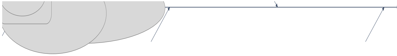
Figure 2. Visual Representation of chapter II