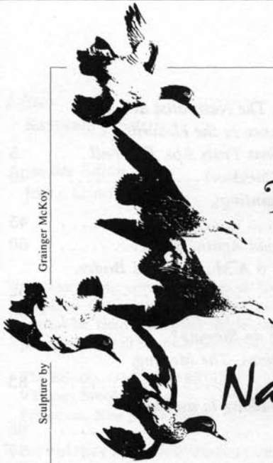
Sculpture by Grainger McKoy